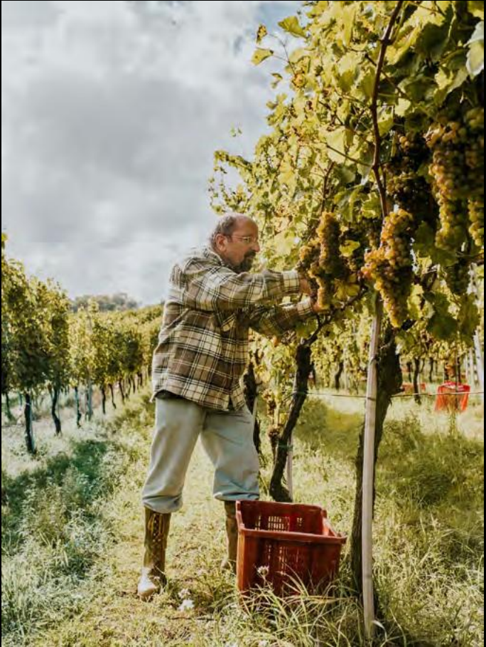
Harvest is done by hand